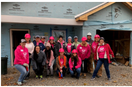
MAD Dream Builders