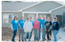
The Real Housewives of Wentzville