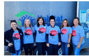
Broads in Boots

Since 1991, Women Build teams have had a pivotal impact in the work of Habitat, starting with a group of women in Charlotte, NC who completed the first women-built Habitat for Humanity house, which planted the seeds for Habitat's Women Build program. Women volunteers from all walks of life have come together to build stronger, safer communities.